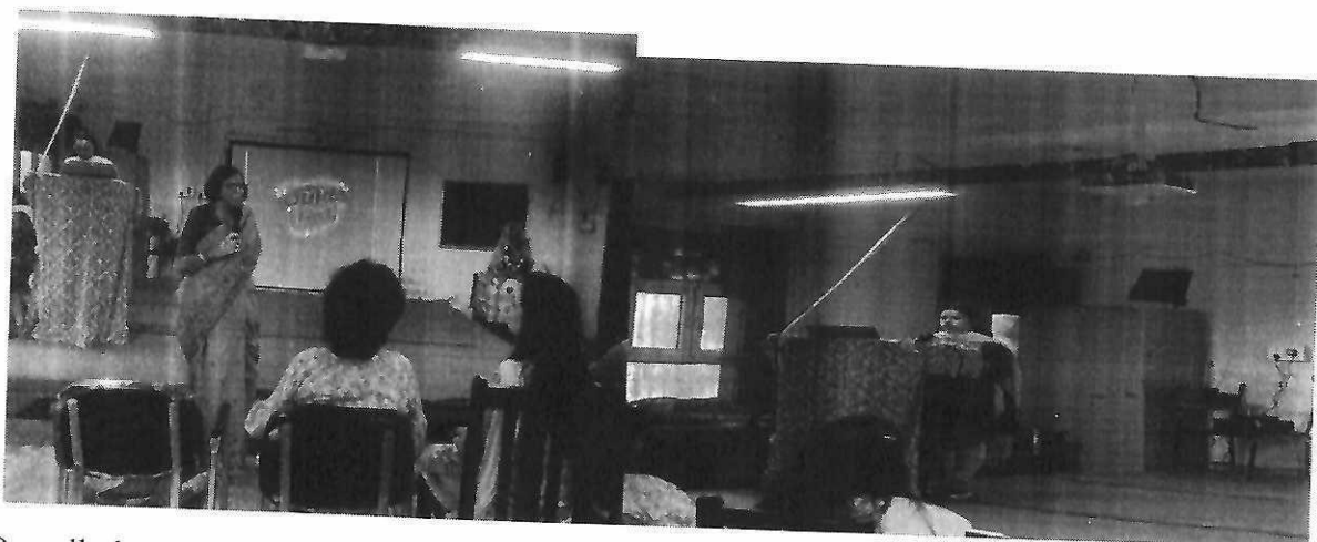
Overall, the programme was a resounding success, with participants leaving more informed and prepared to handle emergency situations. Distribution of sweets among the students and photo session with the teacher.